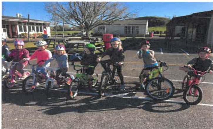
Bike Skills Day—Room 5 above, Room 6 below