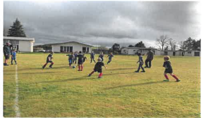
Soccer games 20th June— above Marotiri Magpies below Marotiri Marvels

Ohope Golf Course, 541 Harbour Road, Ohope