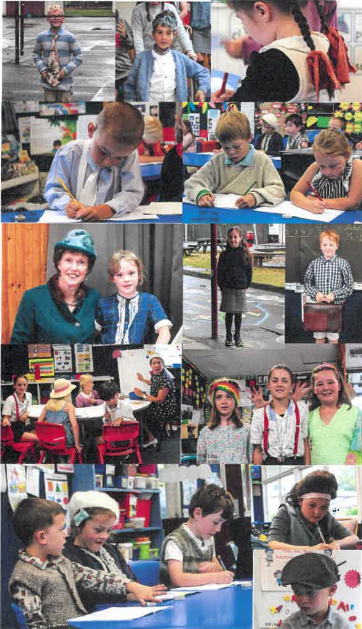
1961 School Day Photos