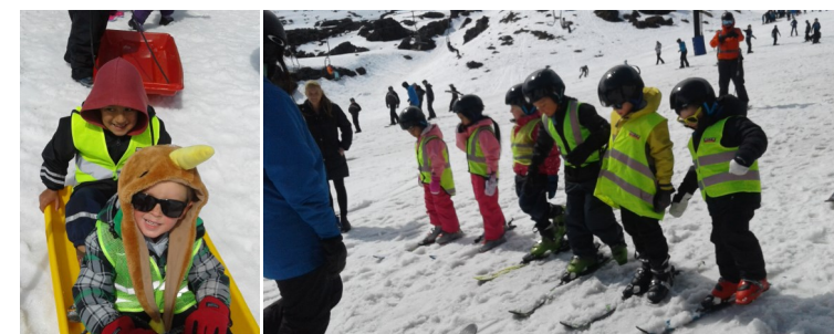
Pictured above: Room 5 & 6 students on their Snow Trip to Mt Ruapehu

Interaction Friday 27th September 1.45pm