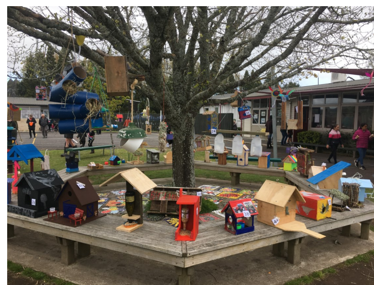
Pictured above: Bird feeders and bird houses entered in the Ag Day competition.