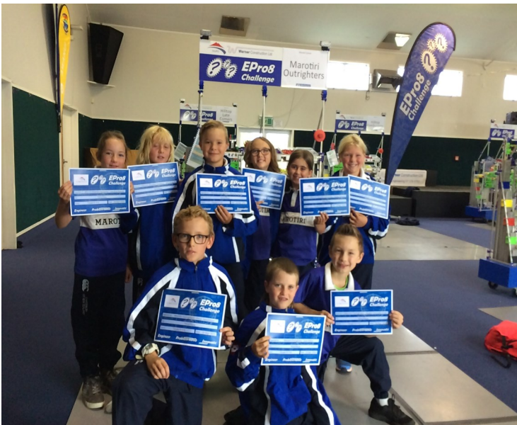
Congratulations Yr5-6 EPRO8 Team—Placed third on 19th March

Student Led Conferences are postponed. They will now be held at a later time.