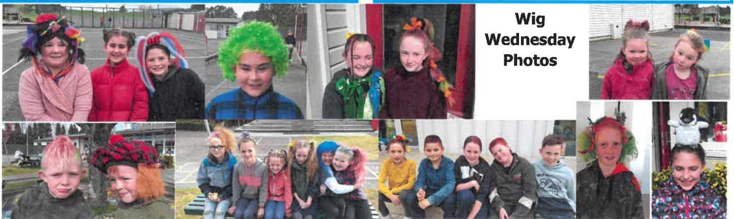
Wig Wednesday Photos