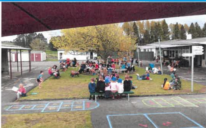
Buddy Reading—older children helping younger children