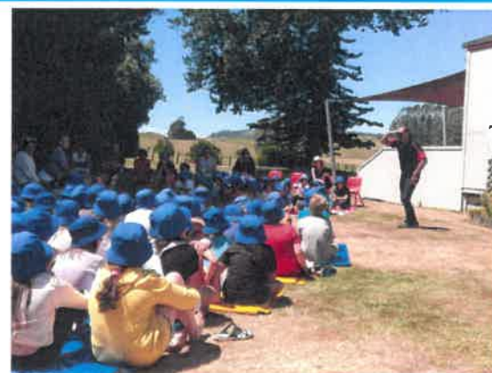
Our Powhiri on Thursday to welcome new students & families