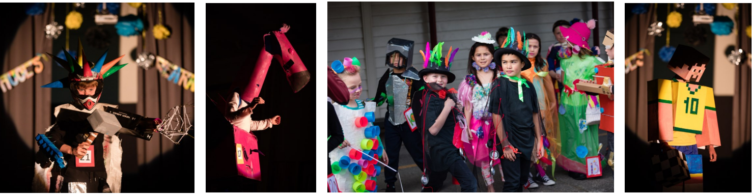
Pictured above: Just a few of the colourful imaginative creations on show at the Wearable Arts Extravaganza last week.